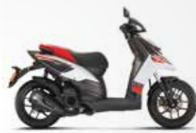
SR MOTARD 125/50