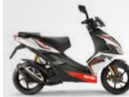
SR R 50