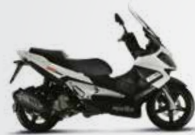
SR MAX 300/125*